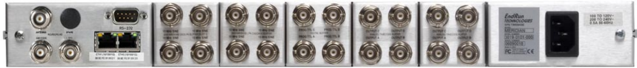
Meridian II Rear Panel with Five Option Modules Installed