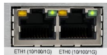
Dual Gigabit Ports

Two independent 10/100/1000 Base-T Ethernet ports are provided. The ports are capable of generating 7,500 NTP packets per second with a timestamp accuracy of better than 10 microseconds. For PTP/IEEE-1588 applications, you can purchase the option to run on one or both ports with a timestamp accuracy of less than 8 nanoseconds. See the PTP/IEEE-1588 option datasheet for details on using Meridian II as a PTP Grandmaster.